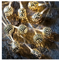
Silver Maroq Lights