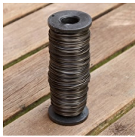
Florist Reel Wire