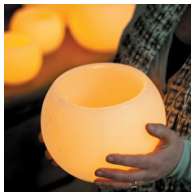
Wax Tealight Holder Globes