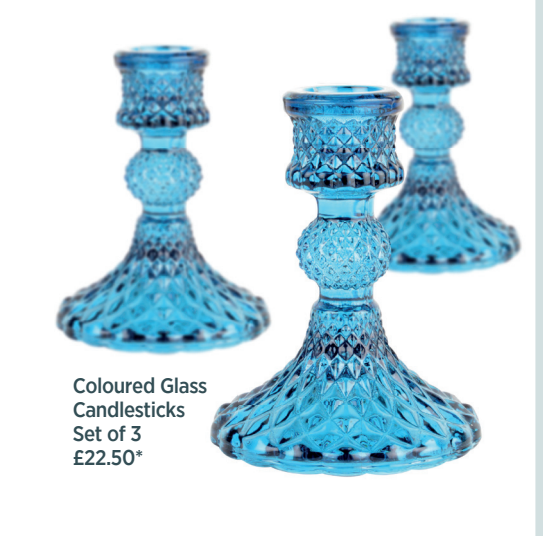
choose from natural hues to blasts of Persian colour

Please contact us for more details of our full range